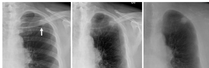
In the MacMahon et al study, radiologists rated a small pulmonary nodule (< 20 mm) as more conspicuous on a bone suppression image (left) than on standard chest radiograph (center), where it was partly obscured by overlying bones. Dual-energy subtraction (right) provided the most complete bone subtraction but required special equipment to perform.

The findings established that the readers were significantly more confident in their interpretation of the bone suppression images than with standard digital chest x-rays. But they also reported significantly more confidence in their readings of dual-energy imaging than with bone suppression imaging.